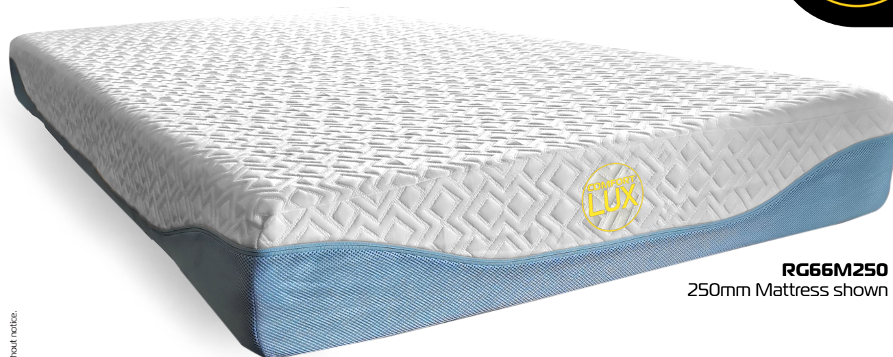
RG66M250 250mm Mattress shown

RG66M150: 150mm Mattress RG66M200: 200mm Mattress RG66M250: 250mm Mattress